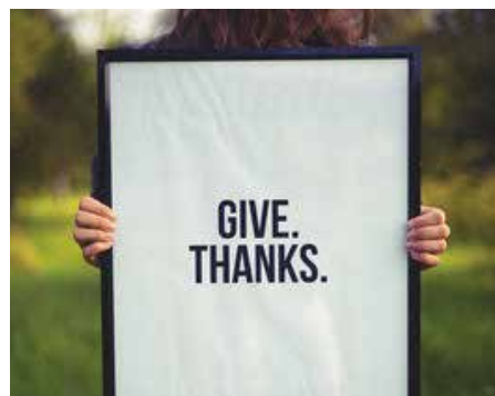
November 25 "Thanksgiving"