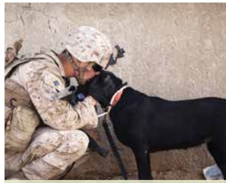
November 11 "Thank You for Your Service"