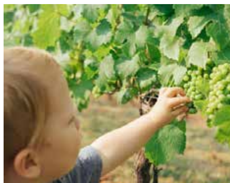
November 18 "Grateful"